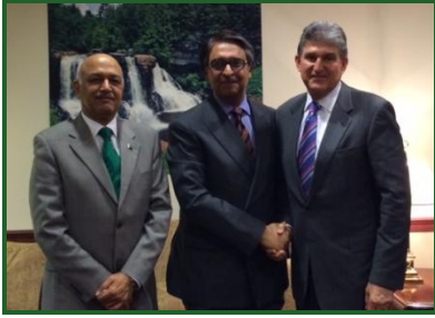
Ambassador Jilil Abbas Jilani and Defence Secretary Lt General (Retd.) Asif Yasin Malik with Senator Joe Manchin (D-WV)

Ambassador Jilil Abbas Jilani, accompanied by Defence Secretary Lt General (Retd.) Asif Yasin Malik, met with Senator Joe Manchin (D-WV) who serves at four important Committees of the Senate, including the Armed Services Committee and the Energy and Natural Resources Committee. Ambassador Jilani briefed the Senator on the state of bilateral