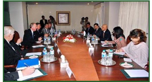
Foreign Secretary, Aizaz Ahmed Chaudhry in meeting with US Congressional Delegation

A four member bipartisan delegation of the House Appropriations Subcommittee on Defense visited Pakistan. The delegation was led by sub-committee Chairman Representative Rodney P. Frelinghuysen and included Congressman Representative Peter Visclosky, Representative James Moran and Representative Kenneth Calvert accompanied by US Ambassador to Pakistan Richard Olson. The delegation met with Foreign Secretary Aizaz Ahmed Chaudhry and discussed Pakistan-US bilateral relations as well as economic, security and counter-terrorism issues. The Foreign Secretary highlighted the Government's focus on economy and energy sectors. Pakistan's commitment to promote relations with its neighbours for regional security and stability was also underscored. The Foreign Secretary stressed on the importance of Pakistan's relations with the US and appreciated American assistance to Pakistan in support of its counter-terrorism efforts.