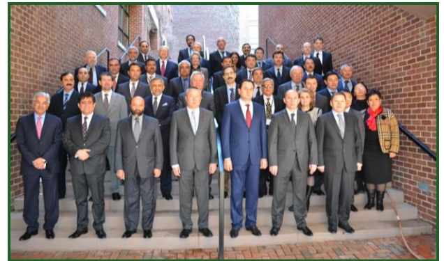
Minister for Water and Power Khawaja Muhammad Asif at the CASA-1000 Project Agreement Discussions held in Washington, DC

The Minister for Water and Power, Khawaja Muhammad Asif and the Energy Ministers of Afghanistan, Kyrgyzstan and Tajikistan convened in Washington, DC to discuss the CASA-1000 Project Agreement. The meeting was organized by the World Bank which is supporting the Project in addition to IDB and USAID. The parties agreed, in principle, on the terms and conditions of the Power Purchase Agreement, conducted negotiations on the Master Agreement and at the same time initiated negotiations on electricity pricing. The consultations round concluded with the signing of a resolution approving, in principle, the terms and conditions of the power purchase between the parties.