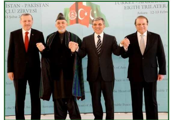
Prime Minister Muhammad Nawaz Sharif with Trukish Prime Minister, Recap Tayyip Erdogan, Afghan President, Hamid Karzai and Turkish President, Abdullah Gul expressing solidarity at the 8 th Afghanistan-Pakistan-Turkey Trialateral Summit in Ankara, Turkey on February 13, 2014

Text of the Joint Statement issued on this occasion can be accessed at http://pid.gov.pk/joint%20statement%202013-2-2014.doc