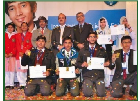
Pakistani participants of the 2014 Intel International Science Fair

Nine students from Pakistan will represent the country at the Intel International Science and Engineering Fair (ISEF) 2014 in Los Angeles in May. The students will participate in the week-long celebration of science, technology, engineering and math. These students also compete for more than US$4 million in awards and scholarships.