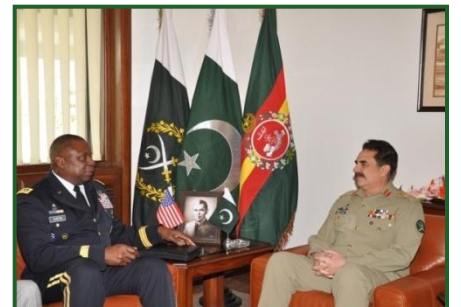
Chief of Army Staff General Raheel Sharif with General Lloyd J. Austin, Commander United States Central Command (CENTCOM)

General Lloyd J. Austin III, Commander of U.S. Central Command (CENTCOM), visited Pakistan, where he held meetings with senior military officials. General Austin discussed a wide range of security issues of mutual interest with Defense Secretary Asif Yasin Malik, Chairman of the Joint Chiefs of Staff Committee, General Rashad Mahmood, and Chief of Army Staff, General Raheel Sharif, along with other senior military officials. General Austin and his counterparts reaffirmed the importance of the US-Pakistan security relationship for regional stability resolved to continue efforts in order to build a stronger partnership and further common objectives.