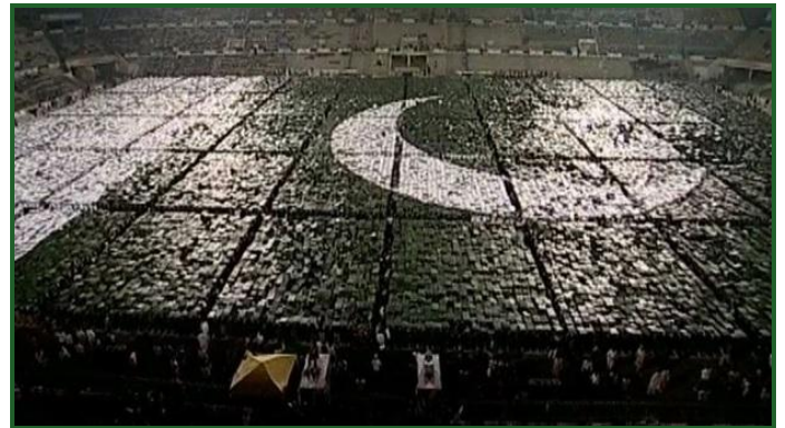
Pakistan sets new Guinness World Record for largest human flag

A total of 29,040 Pakistani youngsters assembled at the National Hockey Stadium with green and white placards on their heads to set a new Guinness World Record (GWR) for the largest human flag. Pakistan has snatched this title from Bangladesh's 27,117 youngsters. Earlier, Pakistan had beaten Singapore in 2012 by forming human flag of 24,210 youngsters.